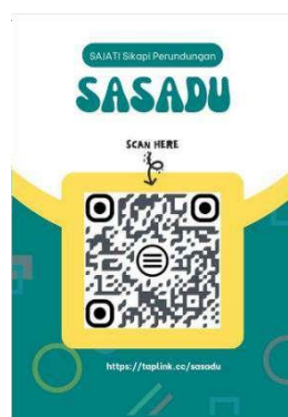
Figure 3. SASADU Poster

One of the efforts undertaken is the installation of posters in various strategic locations around the school. These posters not only serve as educational tools about bullying and its impacts but are also equipped with SASADU barcodes. These barcodes can be scanned by students, teachers, and school staff using their mobile phones to directly access the SASADU website. Through this website, users can report bullying incidents anonymously, obtain information about the different types of bullying, and learn the steps they can take to get help. The installation of posters with SASADU barcodes is a crucial step in ensuring that the entire school community can easily access the necessary resources and support to create a safe and comfortable school environment. Figure 3 below shows the poster display: