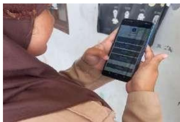
Figure 2. SASADU Simulation