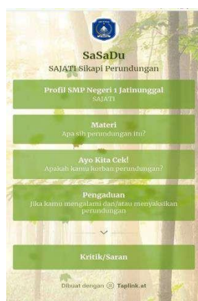
Figure 4. Main Menu of SASADU

SASADU is an innovative program developed by SMPN 1 Jatinunggal, also known as SAJATI, aimed at addressing and preventing bullying within the school environment. Berikut tampilan gambar 4. Menu utama SASADU: