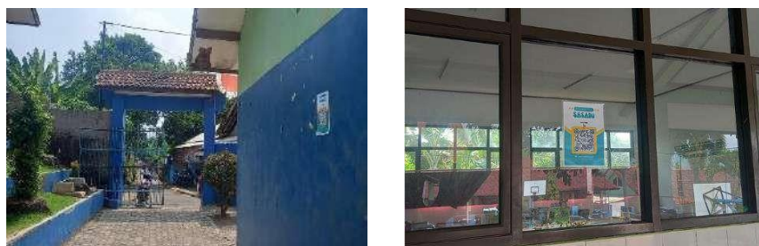
Figure 1. Placement of SASADU Poster

The first stage of this activity is to socialize the program to the entire school community, including students, teachers, and staff. Socialization is conducted through seminars, presentations, and the placement of posters in strategic locations around the school. These posters are equipped with SASADU barcodes that can be scanned to facilitate access to the SASADU application. The aim is to raise awareness about bullying, its various forms, and its negative impacts.