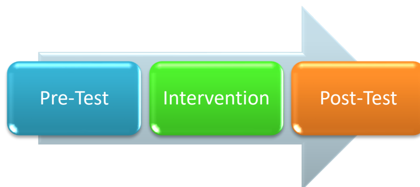
Figure 1. Data Collection Procedure