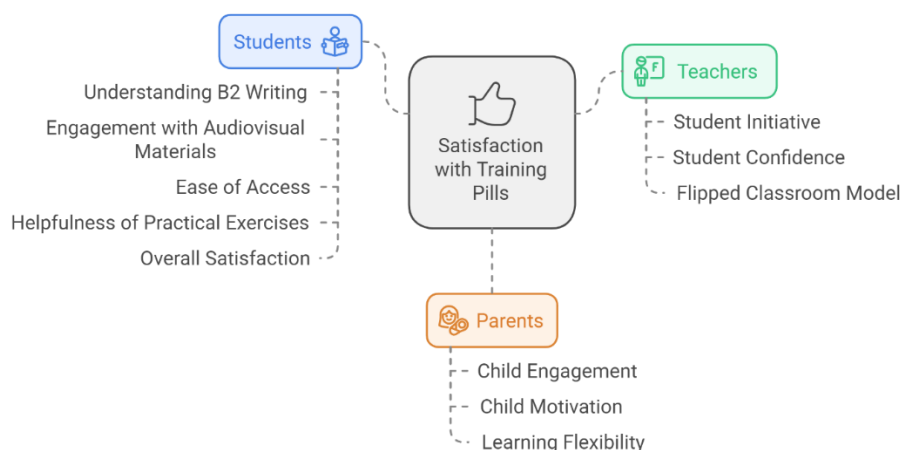
Figure 3. Satisfaction with Training Pills