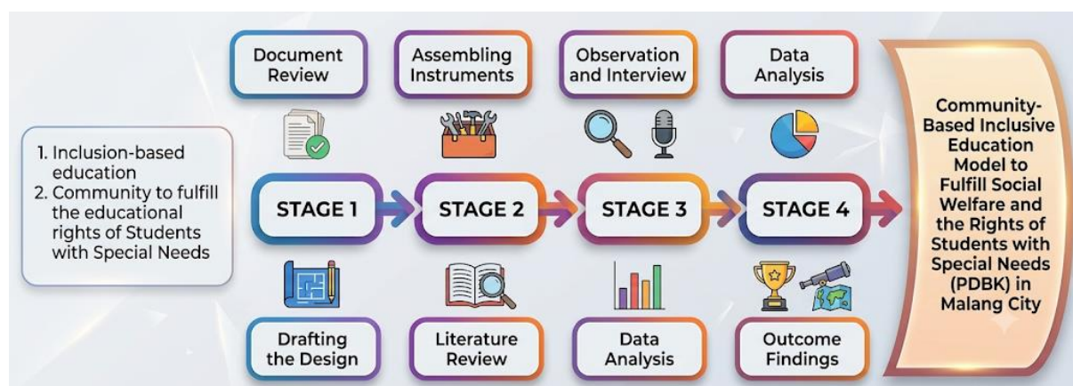
Figure 1. Research Design and Analytical Workflow

The study used a descriptive qualitative, multi-site case-study design. This design was selected because the research questions required an interpretive account of how schools organise inclusive learning, how stakeholders participate, and how a practice model emerges from cross-case patterns. The analysis followed an iterative, reflexive thematic process in which site-level evidence was first coded, then compared across schools to identify shared mechanisms, contextual variation, and implications for model development [31], [32].