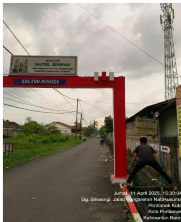
Figure 1. Gang Siliwangi

The study was conducted in a residential drainage network located in Gang Siliwangi, Jalan Pangeran Natakusuma, Pontianak, Indonesia. The drainage system serves a densely populated residential catchment consisting of approximately 43 housing units, with a total channel length of about 458.6 meters. The area represents a typical urban drainage setting in developing regions, where drainage systems function as combined channels carrying both stormwater runoff and domestic wastewater. The relatively flat topography, combined with high rainfall intensity, makes the study area particularly vulnerable to waterlogging and localized flooding events.