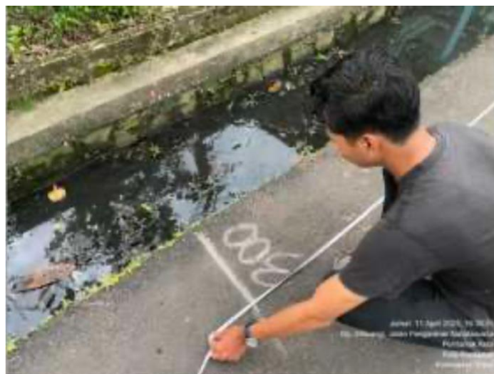
Figure 2. Characteristics of the Study Area

The runoff coefficient ( C ) was determined based on land use characteristics dominated by residential areas, paved surfaces, and limited infiltration zones. As a result, the coefficient indicates a high runoff potential, meaning that a substantial portion of rainfall is directly transformed into surface flow. The design discharge ( Q_r ) was then calculated using the Rational Method, integrating rainfall intensity, runoff coefficient, and catchment area, along with additional domestic wastewater contributions.