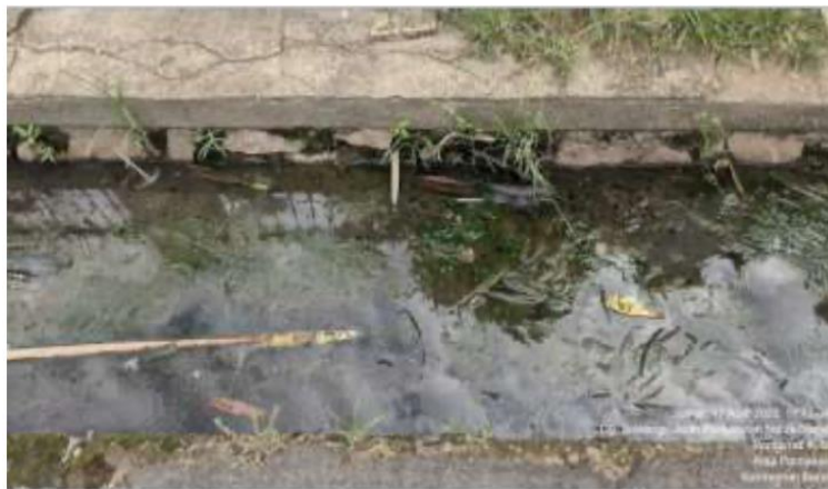
Figure 3. Existing Channel Hydraulic Capacity