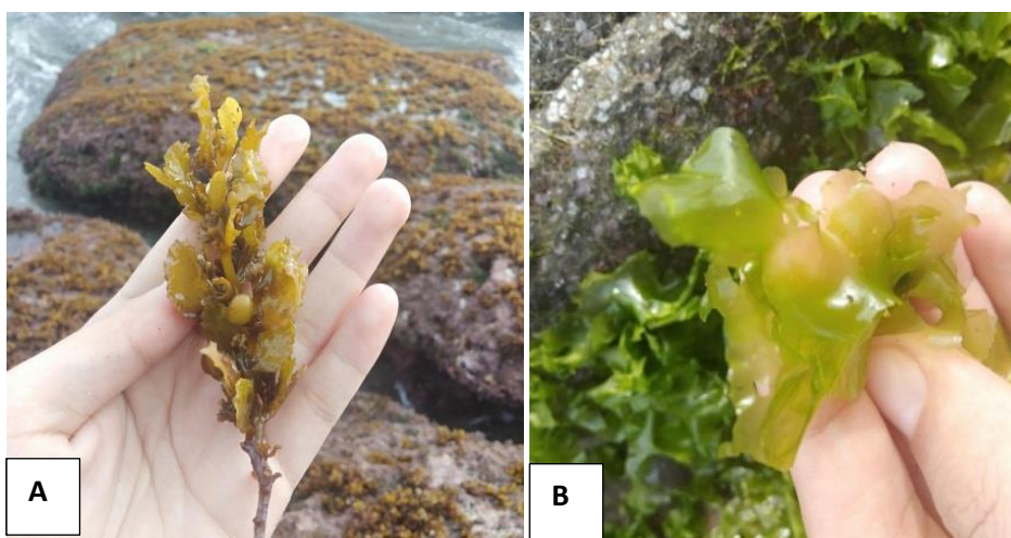
Gambar 1: A. Sargassum polycistum ; B. Ulva lactuca

The collection of seaweed and the production of fertilizer were conducted in Cahaya Negeri Village, Pesisir Barat Regency. The compost quality testing was carried out at the Soil Science Laboratory, Universitas Lampung. This research was conducted from September to November 2020, employing a qualitative approach with a descriptive method. The chemical quality of compost produced from Sargassum polycistum and Ulva lactuca through the composting method was evaluated and compared against the standards outlined in SNI 19-7030-2004.